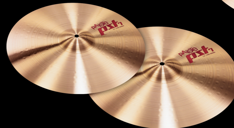
PST 7 17" | 19" THIN CRASH

Warm, airy with a pinch of a brilliant sizzle. Fairly wide range, clean mix. Soft, responsive feel. A light crash for mellow accents and crashes in low to moderate settings.