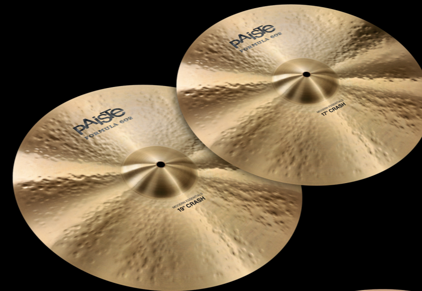
FORMULA 602 «MODERN ESSENTIALS» 17" | 19" CRASH

«For those guys who really appreciate just having a cymbal that can do everything, the larger Dark Crashes can do anything. Very crash-able, and if you want to ride on them, they will give you all the ride patterns in the world.» Gregory Hutchinson