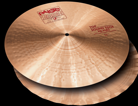
2002 17" SOUND EDGE HI-HAT

Medium bright, full, warm, brilliant. Wide range, fairly complex mix. Fast, responsive feel. Full, bright, energetic open sound. Sharp, full chick sound. The original, once patented, wavy bottom hi-hat design. The 17" version adds extraordinary boost, low end and crisp projection.