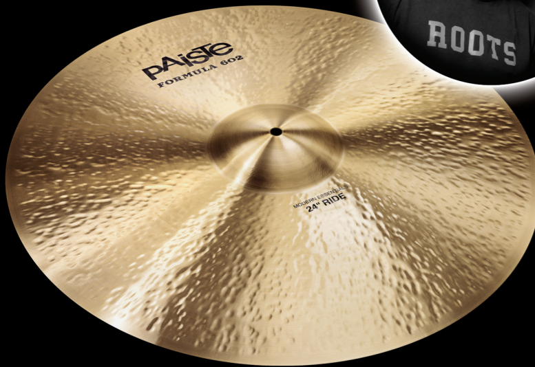
FORMULA 602 «MODERN ESSENTIALS» 24" RIDE

«A translucent warmth with definition and a really good controllable wash in the right proportions. Paiste really exceeded my expectations with the Modern Essentials rides.» Vinnie Colaiuta